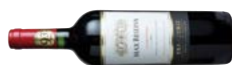
Errazuriz, Max Reserva, Aconcagua 2015 90 AC 90 DVJ 89 PR

‘Cooper noted how the Peumo wines were “beautiful, with a delightful tannin structure”’