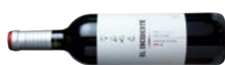
Viu Manent, El Incidente, Colchagua 2016 91 AC 90 DVJ 90 PR 93

£27-£28 Dronfield Wine World, General Wine & Liquor Co, Milestone Wines, Neill & Co, Pimlico Dozen, The Vineyard, Vintage Cellars, Whitebridge Wines A minty bombshell initially that eases into an attractive, intense mix of herbs, sage and spice with charred meat, kirsch, and a finish of mocha. An extrovert wine that will appeal to many. Drink 2019-2021 Alc 14%