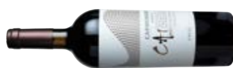
TerraNoble, CA1, Colchagua Andes 2015 91 AC 92 DVJ 90 PR 90

£11.99 Enotria&Coe Elegant, sleek, ripe dark fruit and a hint of wood smoke. It's seductive and youthful, a chocolate and cassis delight. There's pleasant fruit concentration with blueberry pie and spice. Cool and well made. There's lots of wine here. Drink 2019-2021 Alc 13.5%