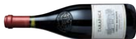
Tarapacá, Gran Reserva, Maipo 2017 91 AC 92 DVJ 90 PR 92

£11.99 Enotria&Coe Elegant, sleek, ripe dark fruit and a hint of wood smoke. It's seductive and youthful, a chocolate and cassis delight. There's pleasant fruit concentration with blueberry pie and spice. Cool and well made. There's lots of wine here. Drink 2019-2021 Alc 13.5%