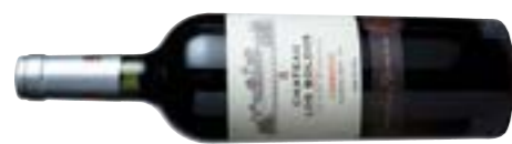
Château Los Boldos, Grande Réserve, Cachapoal Andes 2016 90 AC 89 DVJ 90 PR 91

£46.99 Louis Latour Agencies, Secret Bottle Shop Herbal, roasted red pepper notes. Good spice and energy, nice focus. It's complex without being overly weighty. There is a lovely dense concentration to the fruit. It's ripe, with coconut and coca spice. A nice rich style! Drink 2019-2023 Alc 14%